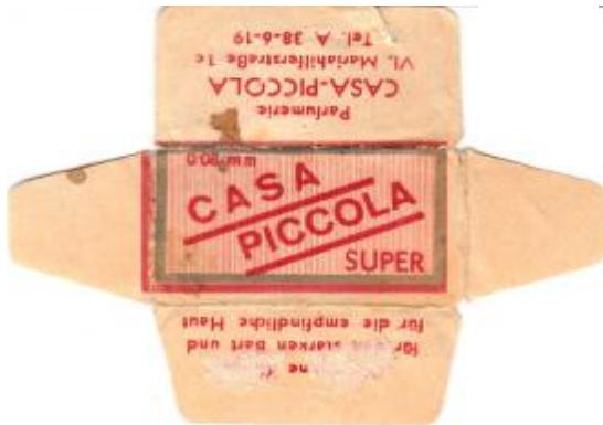
CASA PICCOLA 001