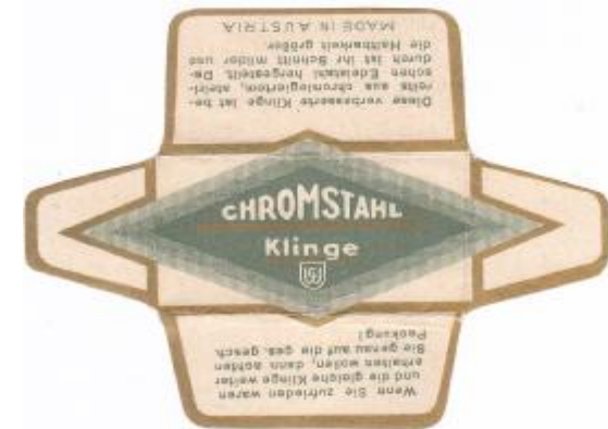
CHROMSTAHL 001 C070