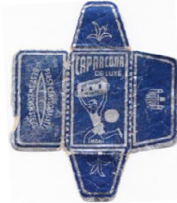
CAP ARCONA 005