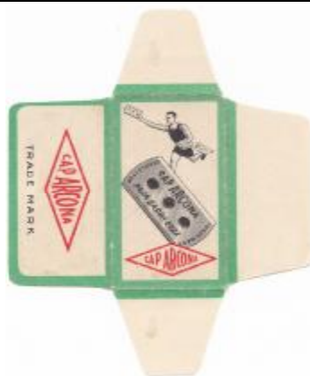
CAP ARCONA 002