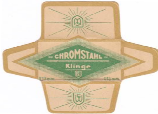
CHROMSTAHL 003 C073