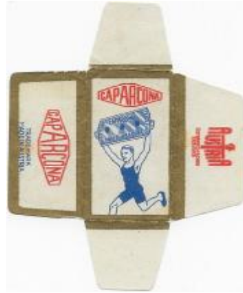
CAP ARCONA 004