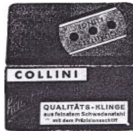
COLLINI 001 C090