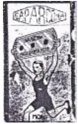
CAP ARCONA 003