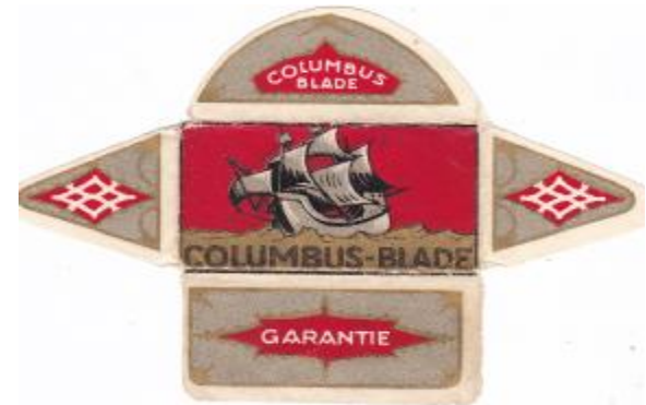
COLUMBUS 001 C110