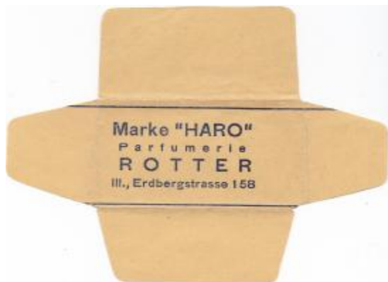
TRANSFERRED TO M