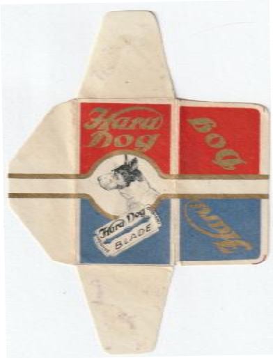
HARU DOG 001