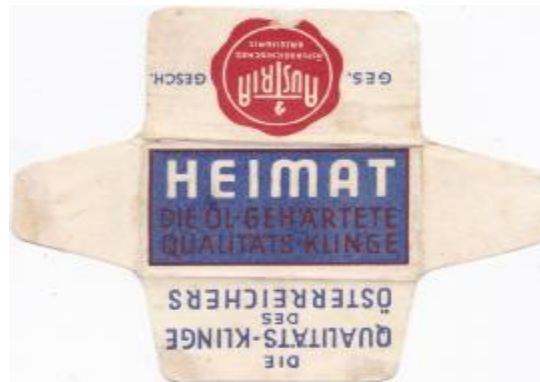
HEIMAT 002 H169