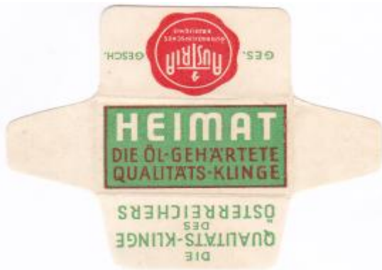
HEIMAT 001 H165