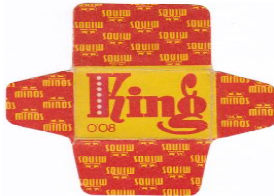
KING 001 K220