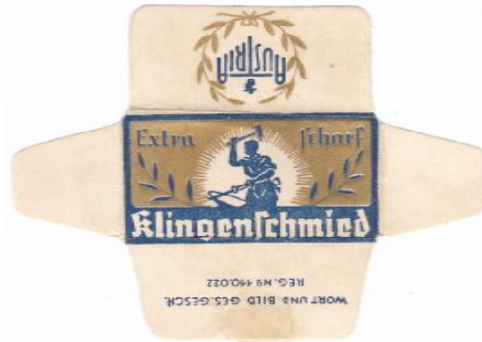
KLINGENSCHMIED 001 K240