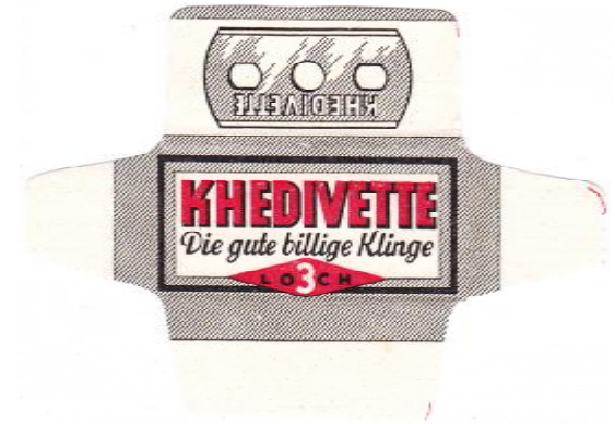
KHEDIVETTE 003 K200