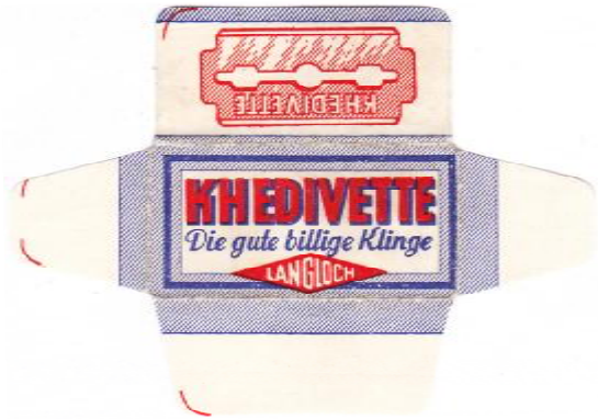
KHEDIVETTE 001 K190