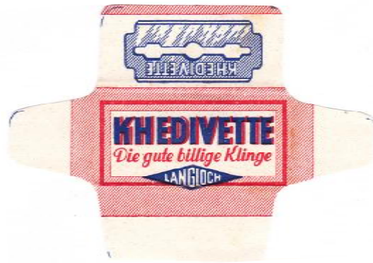
KHEDIVETTE 002 K195