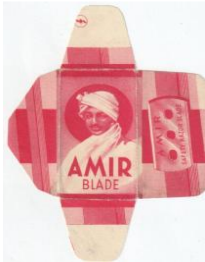
001 wrapper made in Germany